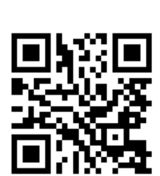
To see a clip of Be My Guest, scan the QR Code above.